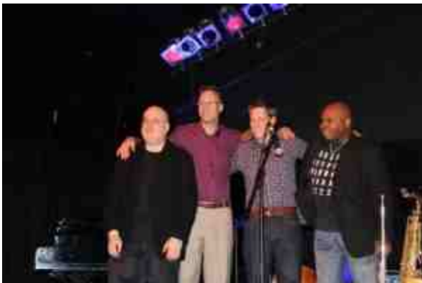
NYSQ

The New York Standards Quartet use words like deconstructed and unstandard to describe to their approach to the standard jazz repertoire. That seemed about right as we listened to a discordant ostinato